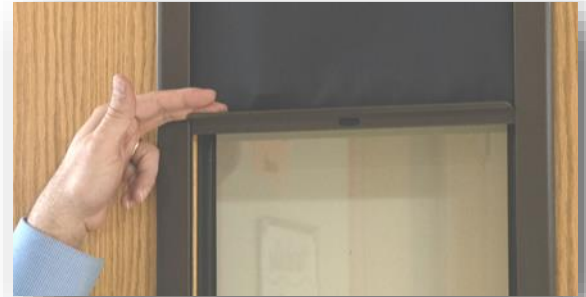
ClassGuard Privacy Screen Pulls Down with One Hand

School Superintendent Kraig Hissong provided feedback on the implementation. "Overall, it's definitely improved the ability to secure the classroom and stay out of the line of sight of an active shooter or someone who might be intruding in the building".