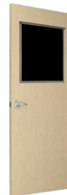
ClassGuard for Doors

The ClassGuard privacy screen for doors was developed to improve door security in a range of facilities including schools. The privacy screen is available for both doors and for sidelites and installs with peel and stick fasteners to existing frames. All components are designed for durability, long life and tamper-resistance.