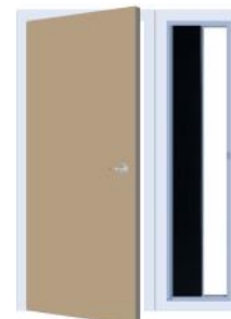
ClassGuard for Sidelites