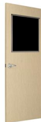
ClassGuard for Doors

The ClassGuard privacy screen for doors was developed to improve door security in a range of facilities including schools. The privacy screen is available for both doors and for sidelites and installs with peel and stick fasteners to existing frames. All components are designed for durability, long life and tamper-resistance.